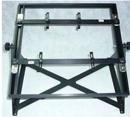
FIG. 1 VIEW OF THE FLIP RACK