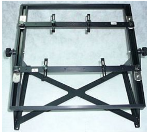
FIG. 1 VIEW OF THE FLIP RACK