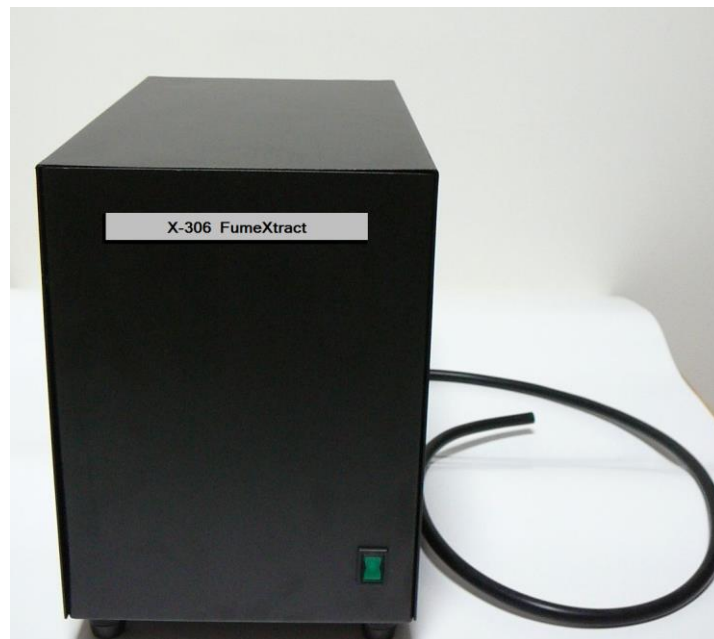
FIG 1. VIEW OF THE SYSTEM

The unit can be supplied from 208-240V and when used to extract fumes from a batch oven can be connected to the outlet provided for this purpose and located on the back panel of X-Reflow306 oven.